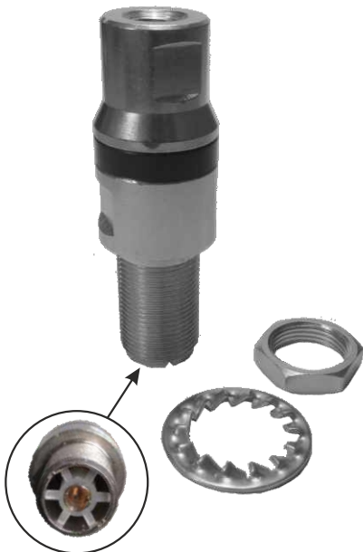
SO-239 for PL-259 connection